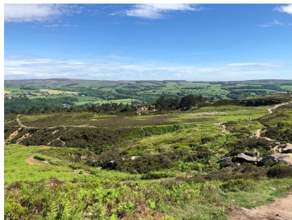
Ain't Yorkshire grand!!!